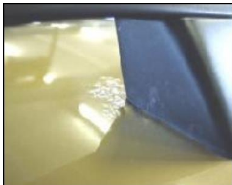
Figure 1 (corrosion on the roof – B5/5.5 Passat shown)

Corrosion on the roof (in the contact area of roof rail/roof rail base) - Figures 1 and 2.