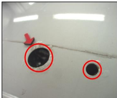
Figure 2 (corrosion around the roof openings – B6 Passat shown)