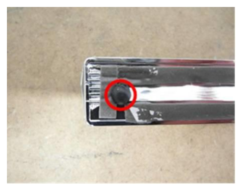
Figure 5 (rear trim strip area)

• Form two balls of butyl sealing cord (part number: AKL 450 005 05) per trim strip with a diameter of 4-5 mm. Attach the butyl balls centrally in the end areas of the trim strip from the inside (Figures 5 and 6).