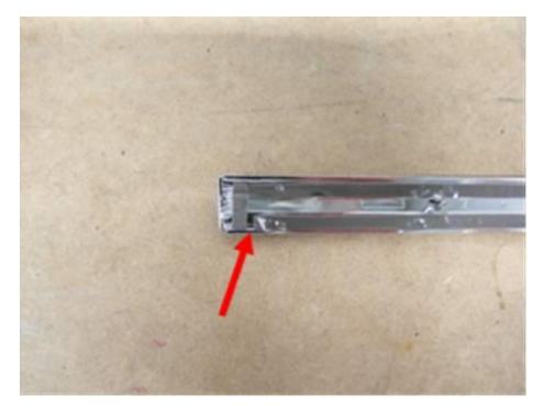
Figure 3 (rear end of a trim strip)

• To avoid repeated water ingress, close the open areas on the trim strips in the end points of the adhesive tape with butyl sealing cord (part number AKL 450 005 05 - Figure 3 and 4, red arrows).