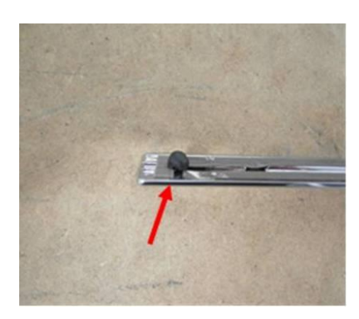
Figure 6 (rear trim strip area)

• The open areas of the adhesive tape must be closed by pressing the butyl balls into the gaps of the tape (Figure 7).