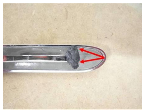
Figure 7 (front trim strip area)

• The open areas of the adhesive tape must be closed by pressing the butyl balls into the gaps of the tape (Figure 7).