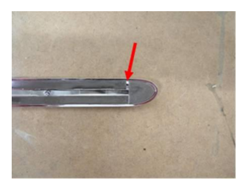
Figure 4 (front end of a trim strip)

• Form two balls of butyl sealing cord (part number: AKL 450 005 05) per trim strip with a diameter of 4-5 mm. Attach the butyl balls centrally in the end areas of the trim strip from the inside (Figures 5 and 6).