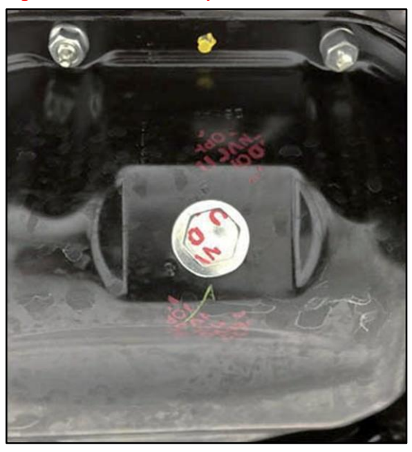
Figure 2. Indication of Inspection Label Removal

4. Complete Section A of the "Engine Oil Consumption Test" at the end of this bulletin.