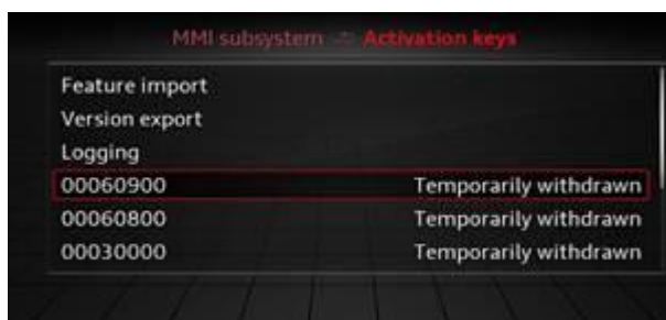
Figure 4. Activation keys showing "Temporarily withdrawn."

Illegal = This indicates that the activation key currently stored in the MMI is not for the vehicle in which it is currently installed. This status is normal for all service parts. If the part is original, this can be an indication of a software issue. Follow the Repair Procedure below.