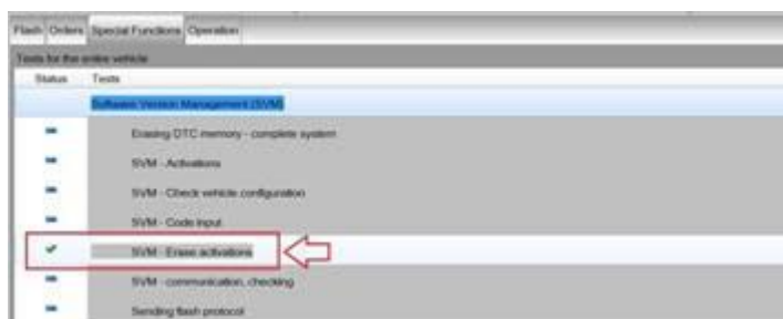
Figure 5. SVM – Erase activations.