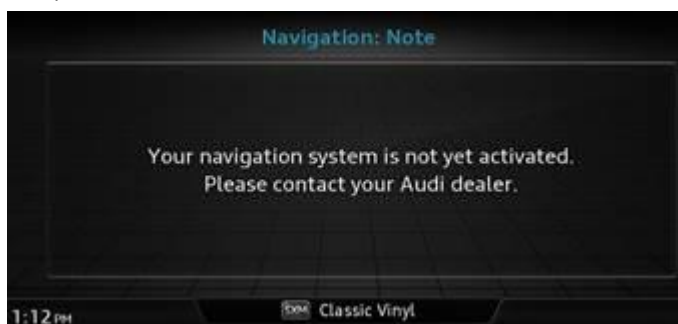
Figure 3. Navigation not activated message (New MIB2 HMI).