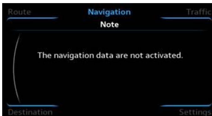
Figure 2. Navigation not activated message (Original MIB HMI).