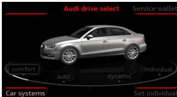
Figure 1. Audi drive select functions unavailable and greyed-out.