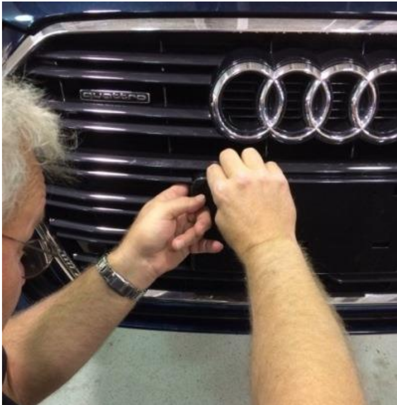
Figure 4. Installing the clip from the side of the license bracket.