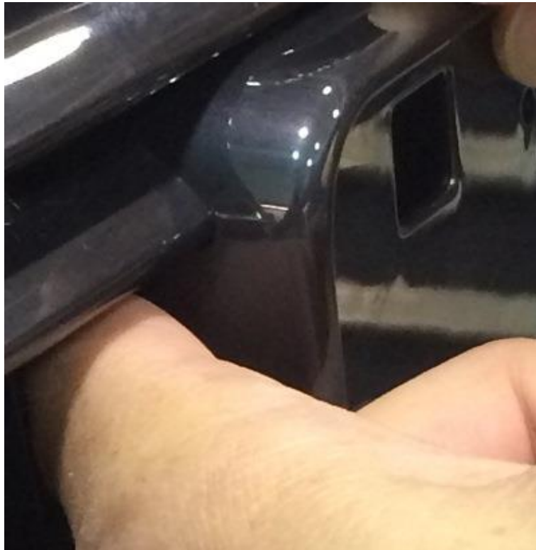
Figure 5. Pushing the clip into position.