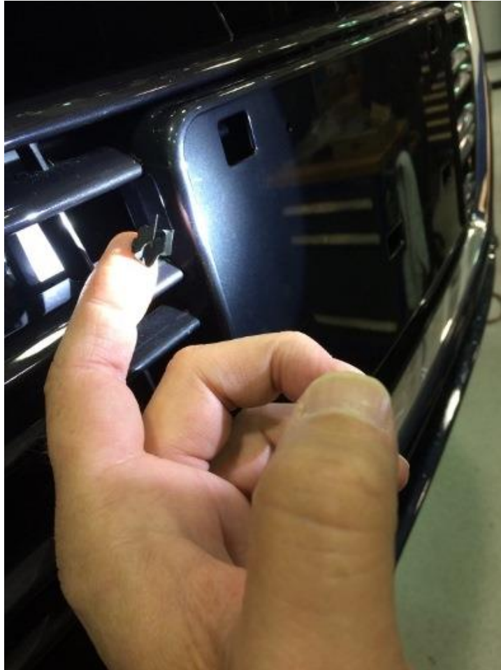
Figure 3. Applying a tacky substance to keep the clip on the end of your finger.