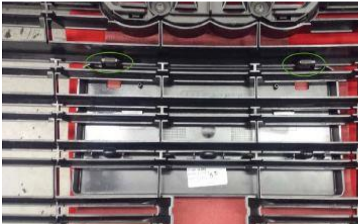
Figure 6. Correctly installed retaining clips as viewed from inside the grille.