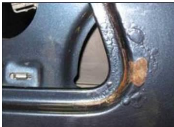
Figure 2: Example: rear lid when rear light is removed