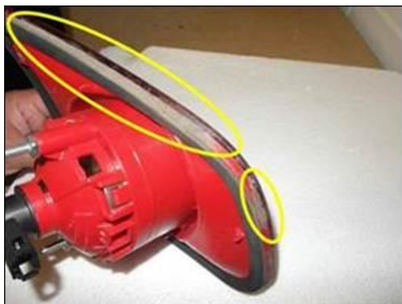
Figure 3 Dirt on rear lights

Dirt between the rear lid surface and rear lights can cause paint damage (Figure 3).