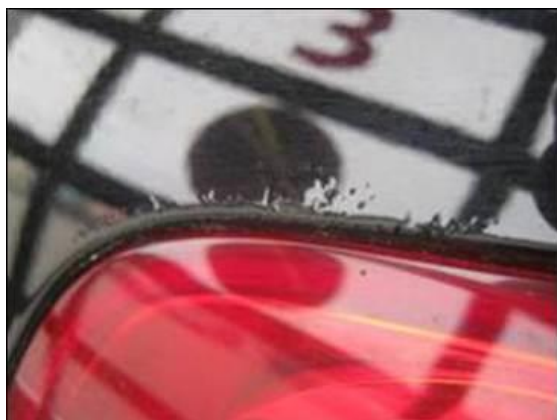
Figure 1: Example: rear lid when rear light is installed