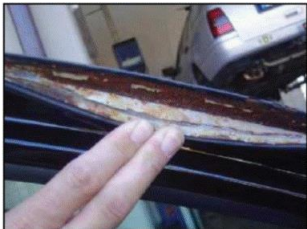
Figure 3 (Paint Group 03) – Door Replacement