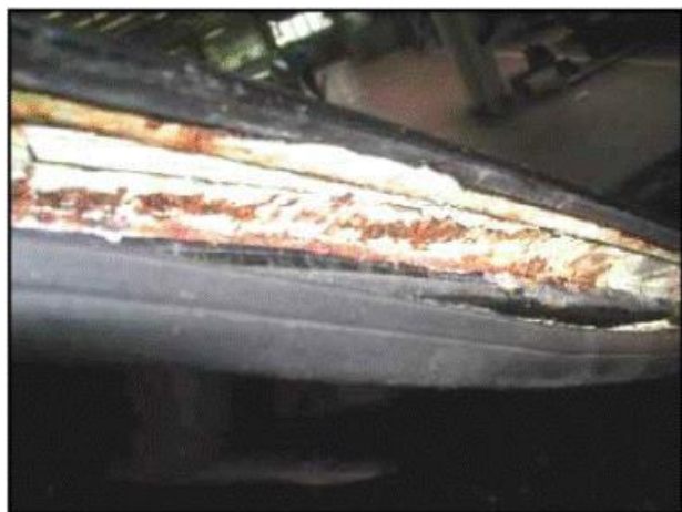
Figure 2 (Paint Group 01/02) – Door Repair