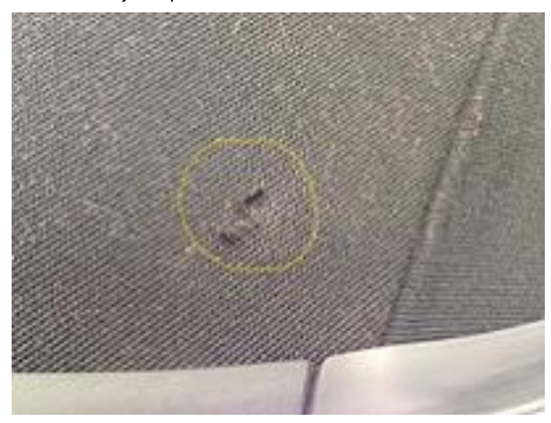
Figure 1: Example of wear mark in top material

Customer may complain of wear marks on either side of the convertible top (see Figure 1).