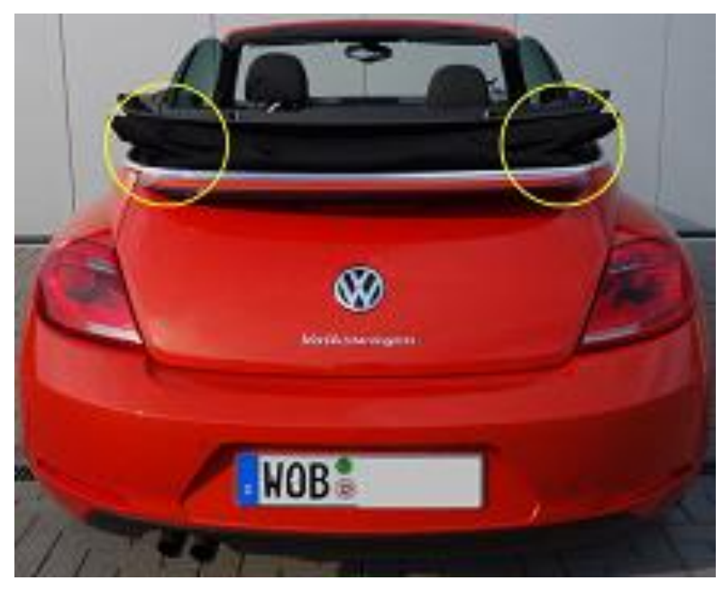
Figure 2: Overview of convertible top cover when stored.

• Check the distance between the fold of the linkage and the fold of the convertible top cover on the left and right side when the convertible top cover is stored (Figures 2, 3 and 4).