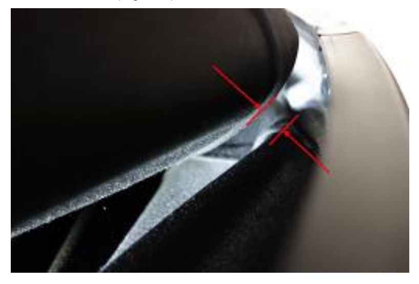
Figure 4: Ensure a 3 mm gap exists between the folds of the convertible top cover when stored (both sides).

The distance of the folds between linkage and convertible top cover in the area of the stitched seam must be at least 3 mm (Figure 4).