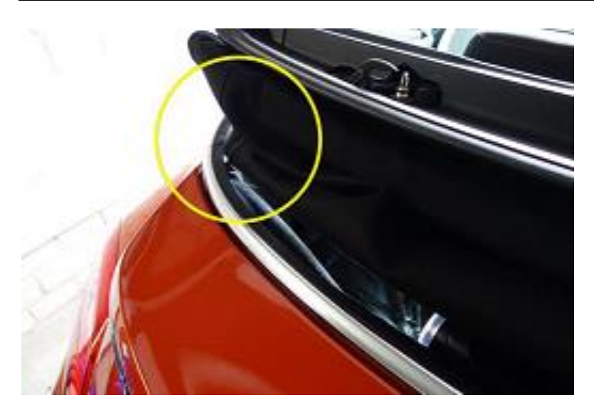
Figure 3: Area of concern (both left and right sides)

The distance of the folds between linkage and convertible top cover in the area of the stitched seam must be at least 3 mm (Figure 4).