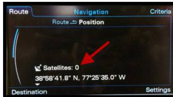
Figure 1. No satellite reception.