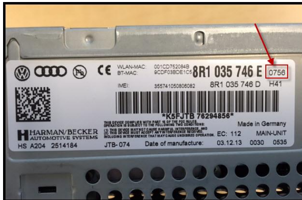
Figure 3. Main unit part label.