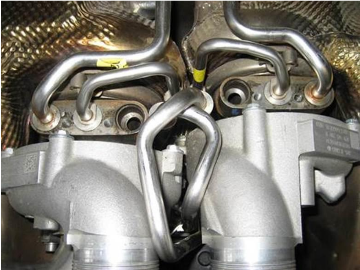
Figure 2. Recommended pipe position.