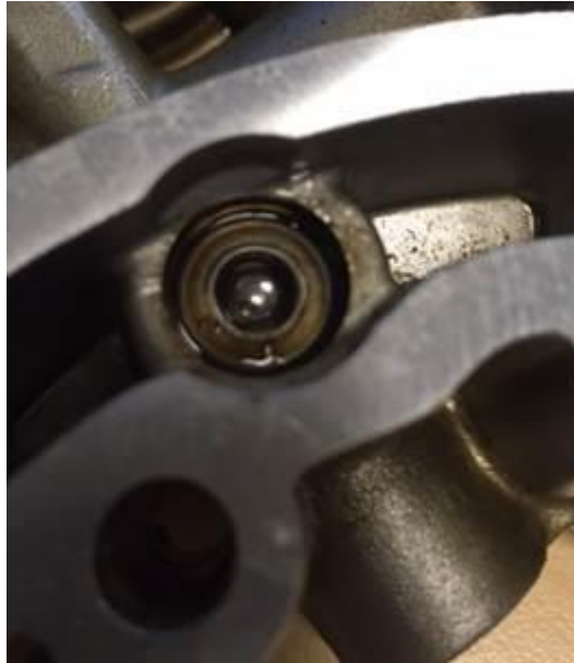
Figure 4. Non-return valve with removed screen housing.