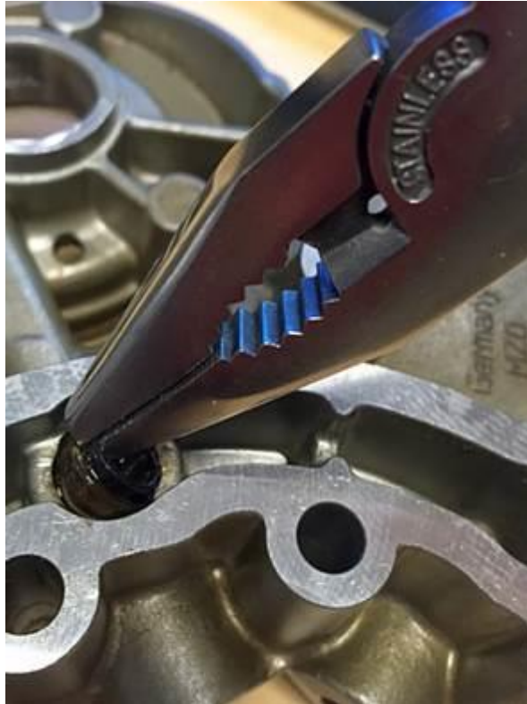
Figure 3. Removal of screen housing.