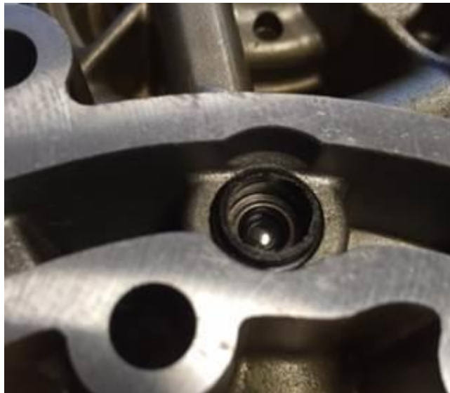
Figure 2. Damaged screen of the non-return valve in camshaft bridge.

Pulsations in the oil circuit can cause the screen on the non-return valve to fail.