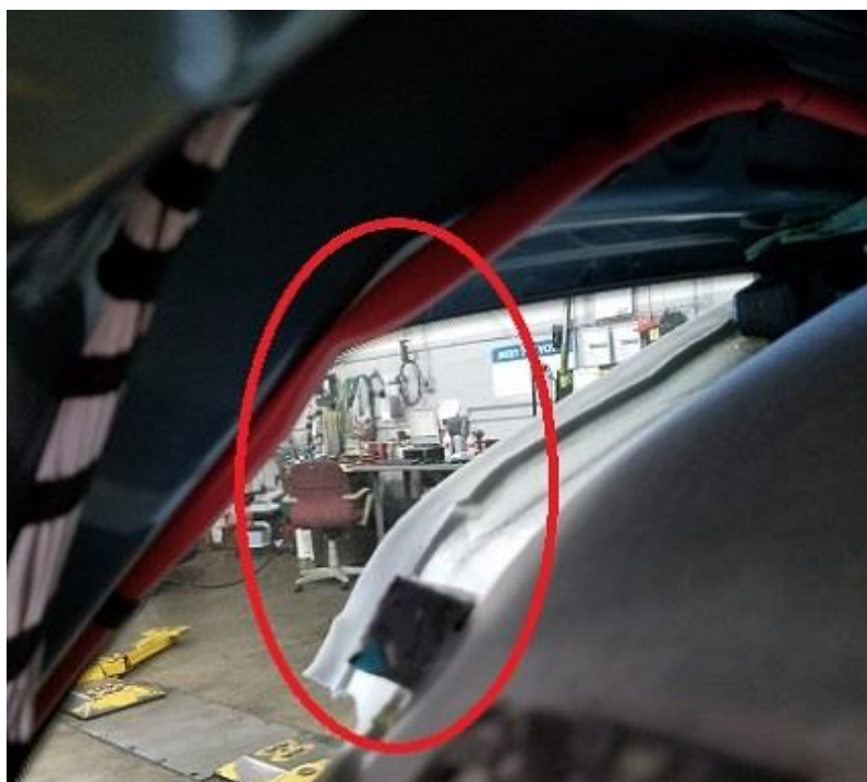
Figure 1: Sunroof drain pinched by foam block on headliner

The rear sunroof drains may be pinched shut by foam blocks on the headliner, not allowing the sunroof frame to drain properly (See Figure 1).