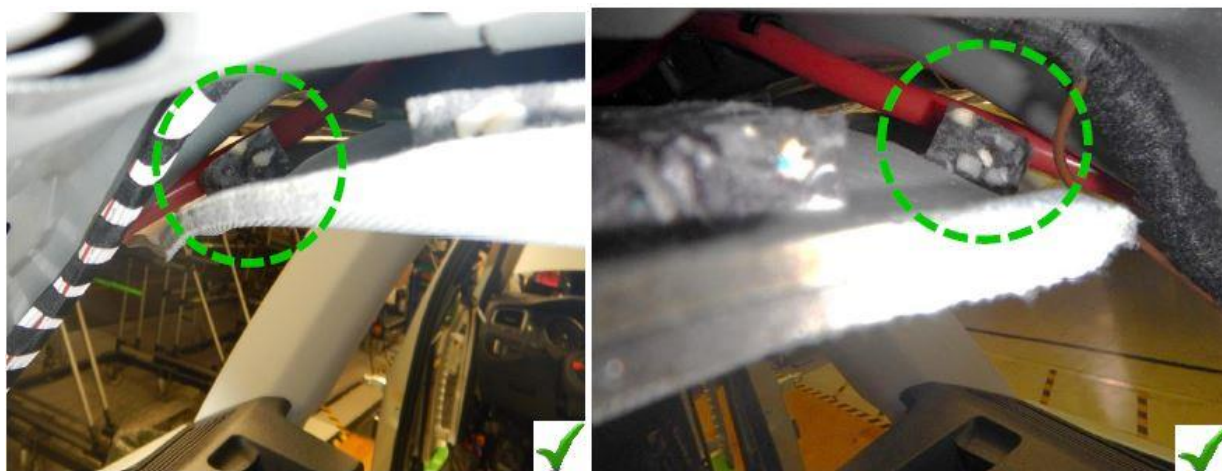
Figures 6 and 7, Rear drain hoses routed behind foam blocks on headliner.

3. Reinstall the headliner ensuring the foam blocks do not contact either of the sunroof drain hoses (See Figures 6 and 7).