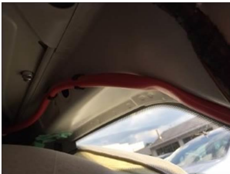
Figure 3: Impression on rear sunroof drain from contact with headliner foam block.

The headliner bends easily. Replace the headliner if it is bent.