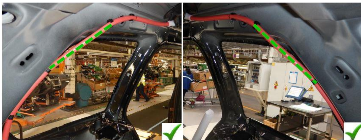
Figures 4 and 5: Correct routing of left and right rear drain hoses with no slack between the 2 nd and 3 rd mounting clips.

During installation of the new drain hoses, ensure the hose is pulled taut between the 2 nd and 3 rd mounting clips and that there is no excess slack in the hose (See Figures 4 and 5).