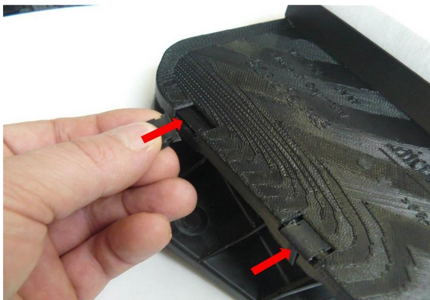
Figure 3: example Jetta: attachment of the filter housing on the air intake grille with clips part number 7L6 133 847 A (red arrows).