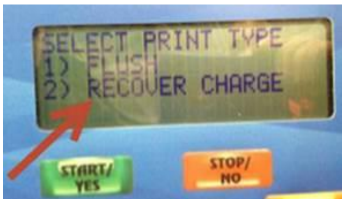
Figure 4: Location of the Print button.

6. When the SELECT PRINT TYPE screen opens, use the keypad to select 2) RECOVER CHARGE