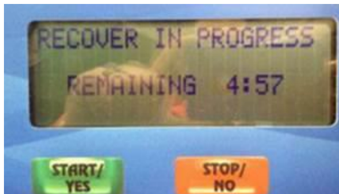
Figure 2: System recover process.

3. Perform a recovery of the system (Figure 2).