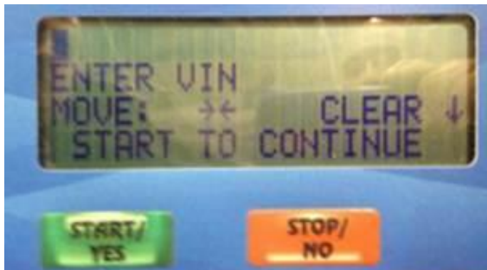
Figure 6: Enter VIN screen.

7. On the next screen, use the keypad enter the last 8 digits of the VIN then press the START/YES key (Figure 6).