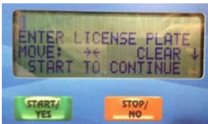
Figure 7: Enter license plate screen.

7. On the next screen, use the keypad enter the last 8 digits of the VIN then press the START/YES key (Figure 6).