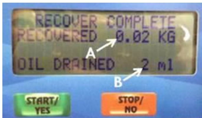
Figure 3: Amount of refrigerant recovered (A), and amount of oil drained (B).

3. Perform a recovery of the system (Figure 2).