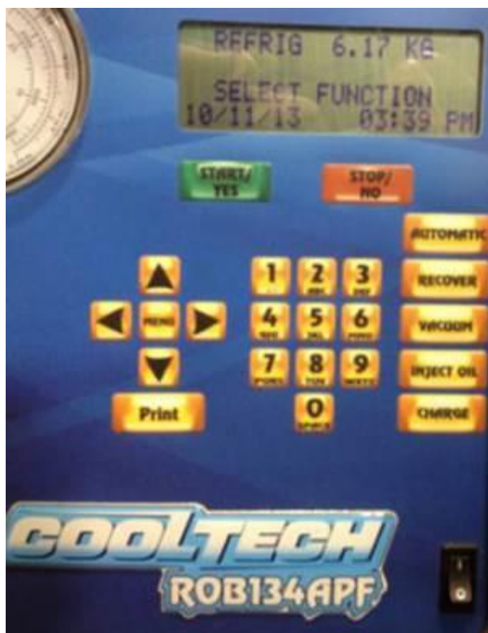
Figure 1: Date and time screen.

1. Ensure that the A/C service unit shows the correct date and time (Figure 1). If the date and time are incorrect, use the menu to program the correct date and time before proceeding.