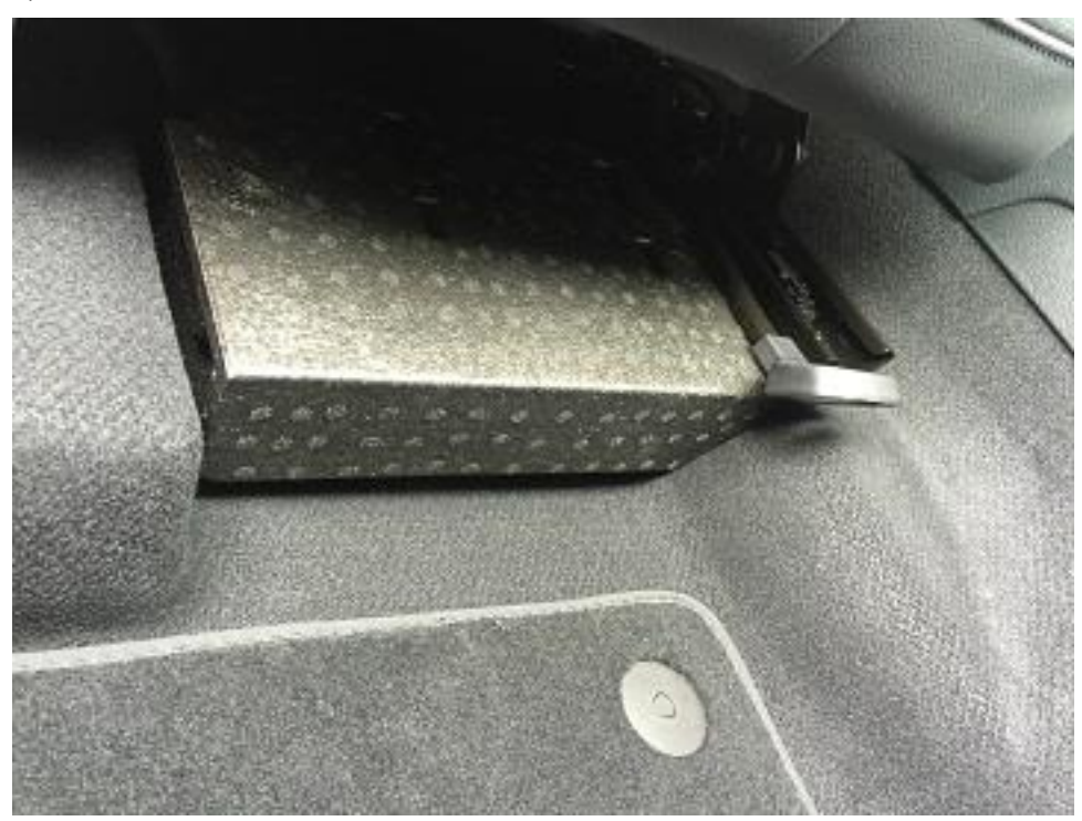
Figure 1: Car-Net module housing loose

During PDI inspect the Car-Net module housing which is mounted underneath the passenger front seat (Figure 1).