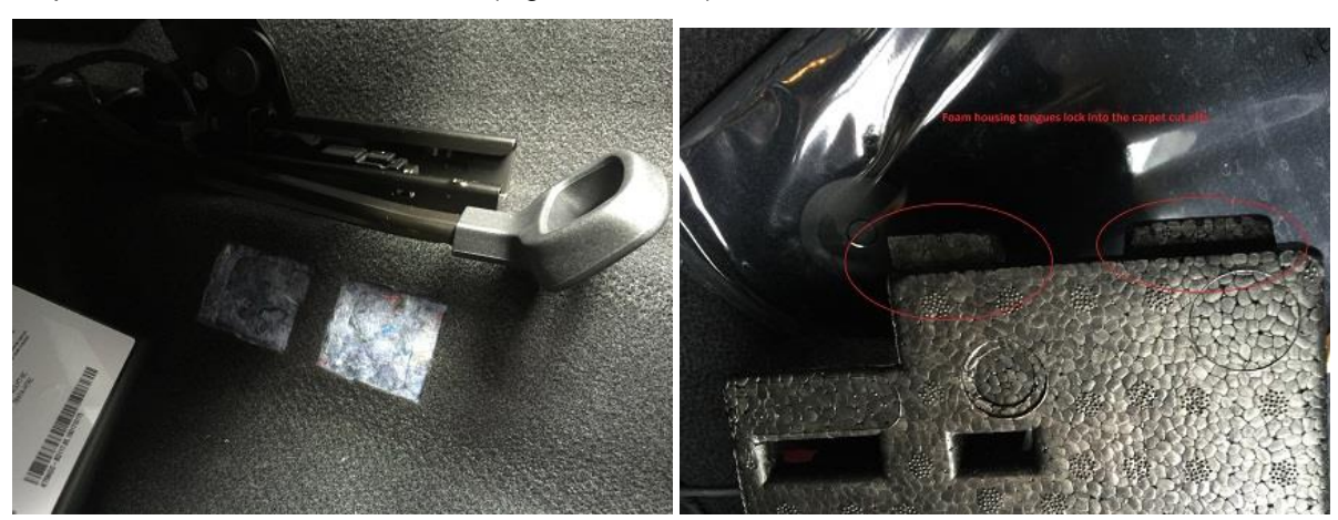
Figures 3 and 4: Carpet cut-outs removed and locking tabs on housing

Remove the carpet cut-outs if they haven't already been removed and reinstall the module housing by first inserting the tabs on the housing through the cut-outs in the carpet, then pressing the housing down onto the carpet to secure the Velcro fastener (Figures 3 and 4).