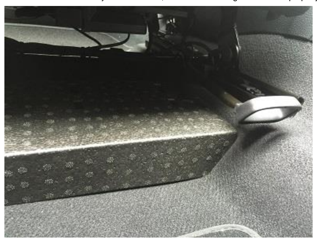
Figure 5: Car-Net module housing properly installed.

If the cut-outs have already been removed, ensure the housing is reinstalled properly (Figure 5).