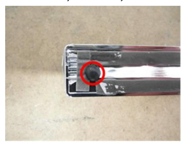
Figure 5 (rear trim strip area)

• Form two balls of butyl sealing cord (part number: AKL 450 005 05) per trim strip with a diameter of 4-5 mm. Attach the butyl balls centrally in the end areas of the trim strip from the inside (Figures 5 and 6).