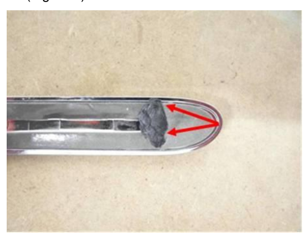
Figure 7 (front trim strip area)

• The open areas of the adhesive tape must be closed by pressing the butyl balls into the gaps of the tape (Figure 7).