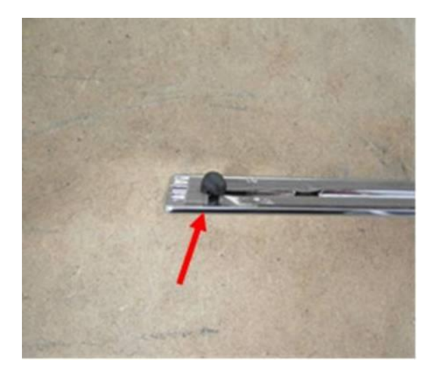
Figure 6 (rear trim strip area)