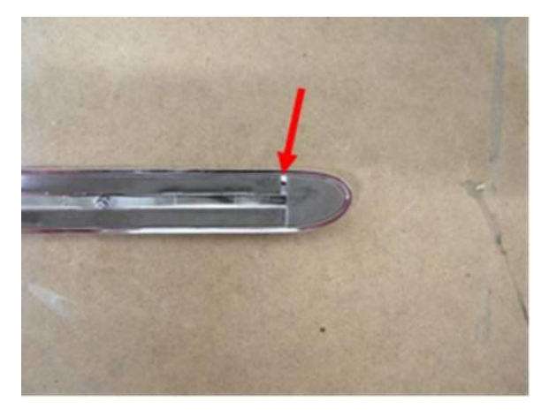
Figure 4 (front end of a trim strip)