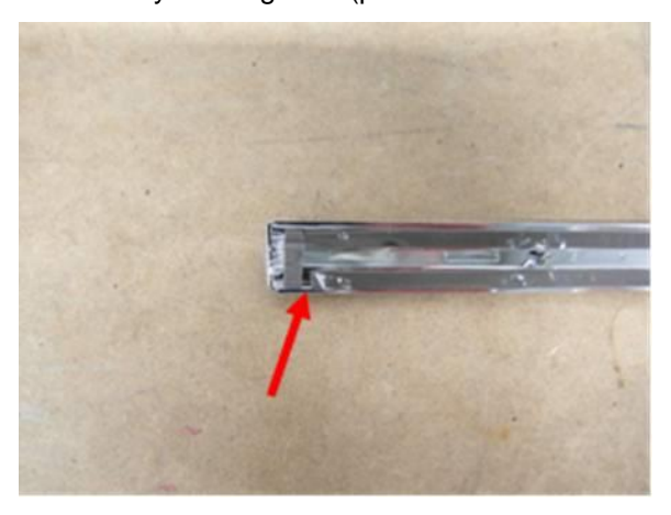
Figure 3 (rear end of a trim strip)

• To avoid repeated water ingress, close the open areas on the trim strips in the end points of the adhesive tape with butyl sealing cord (part number AKL 450 005 05 - Figure 3 and 4, red arrows).