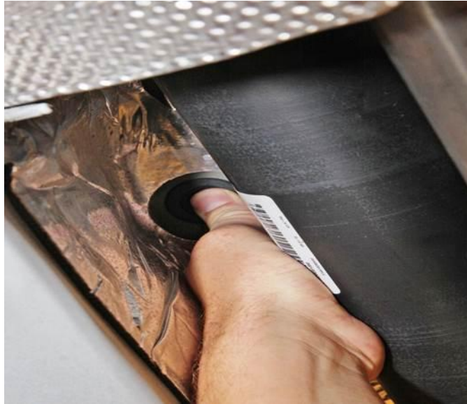
Fig. 3 Installing Rubber Plug