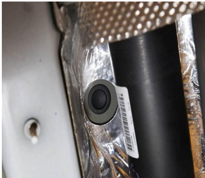
Fig. 4 Plug Installed