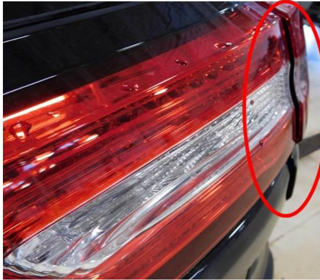
Fig. 1 Underflush Tail Lamp

Liftgate tail lamps look underflush to body mounted tail lamps (Fig. 1).