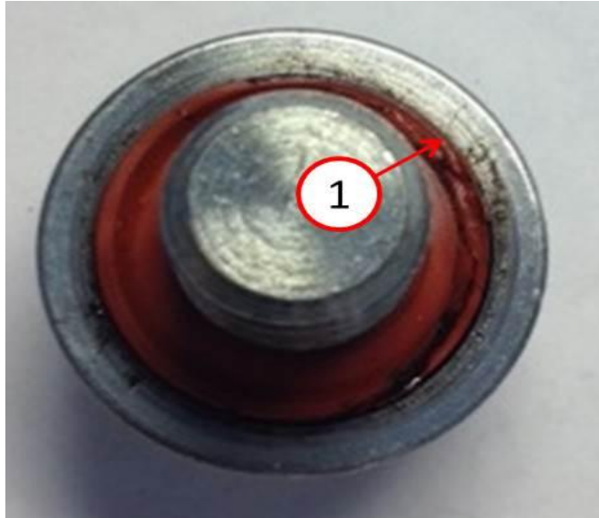
Fig. 2 Damaged Rubber Seal