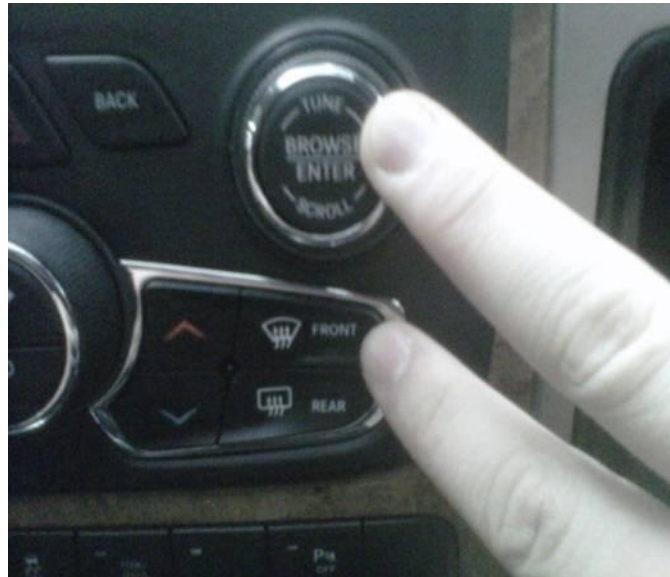
Fig. 2 Take Vehicle Out of Ship Mode