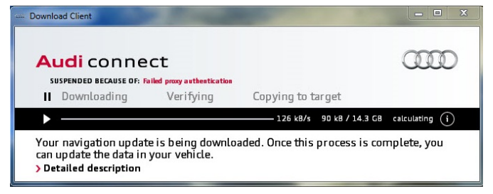
Figure 3. Download manager