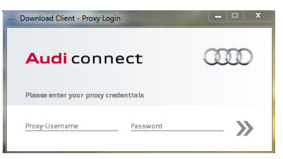
Figure 5. Login prompt for my.audiusa.com

5. If the data was downloaded to the SD card correctly, the SD card will be highlighted in white (Figure 7). If no SD card is highlighted, ask the customer to troubleshoot the issue (Check formatting and verify that all the data is in the root directory of the media).