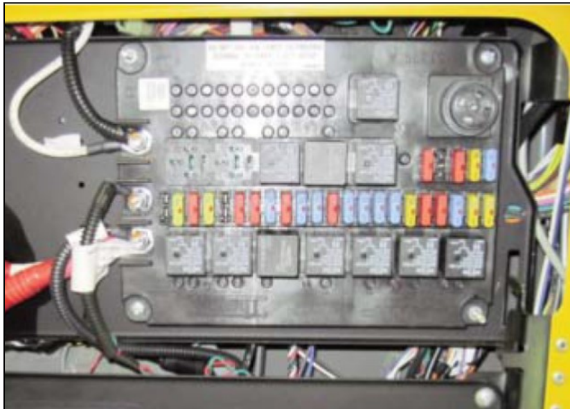
Figure 1, PC Board 1 with cover removed