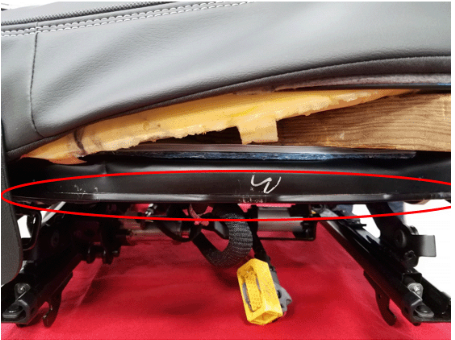
Entirely or partially remove the outboard trim cover and create clearance to the outer corner of the cushion pan hem surface (passenger seat shown).