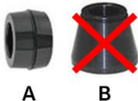
Figure 3. Example of a collet (A) vs. a centering cone (B).