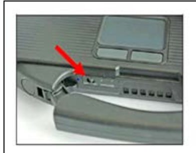
VAS 6150 & VAS 6150A (Front panel behind handle)

The Bluetooth function of the scan tool MUST BE PHYSICALLY SWITCHED OFF prior to performing this update. <See pictures>