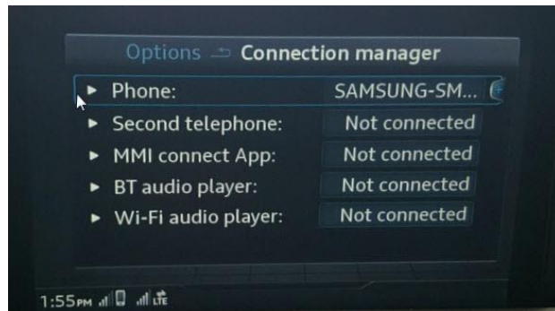
Figure 1. Connection Manager without ASI

The customer complains that Apple CarPlay or Android Auto do not function in the MMI, with no option in the MMI's connection manager (Figure 1), and the vehicle is a 2017 A3 e-tron.