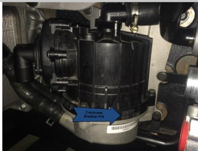
Figure 2: CCOS Part Number

Item 1: No baffle Item 2: Stamped steel baffle