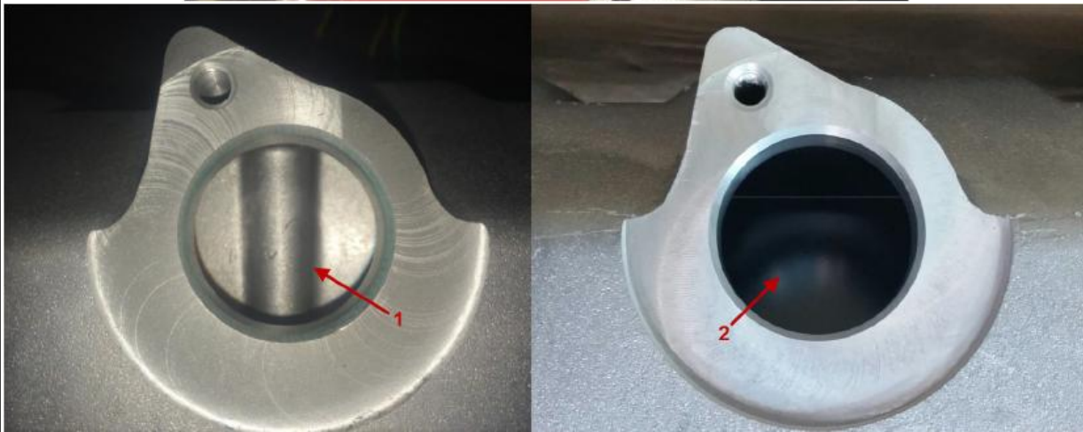
Figure 1: Valve cover baffling vs non-baffled

Item 1: No baffle Item 2: Stamped steel baffle