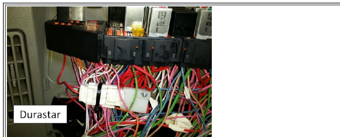
Figure 4: Rectifier Diode Inspection