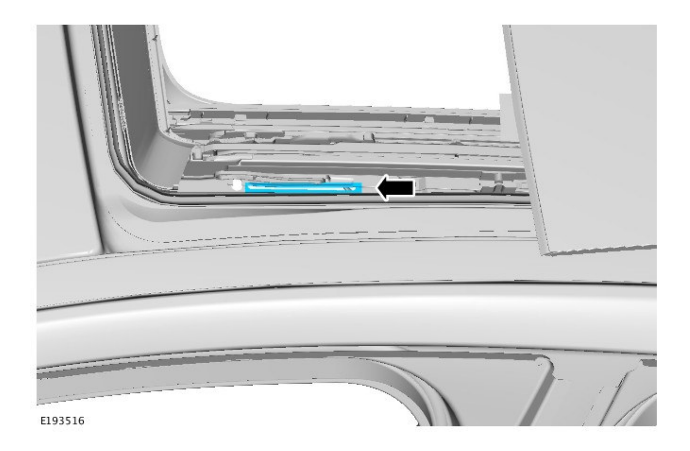
5. Cut and discard 20 mm from the rubber seal.