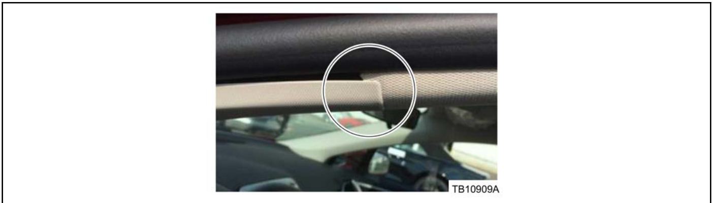
Figure 1 - Article 16-0112