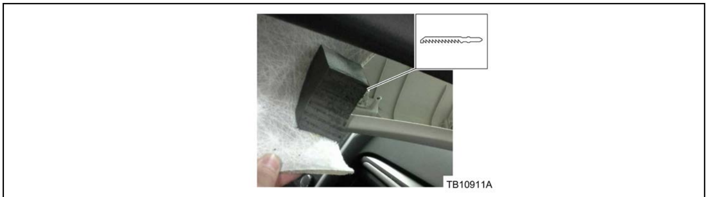
Figure 3 - Article 16-0112