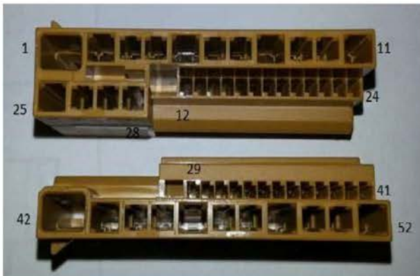
Black connector is connector A

switch is already installed. If so skip this step, If not remove hood latch and install the micro switch into the hood latch.