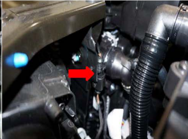
Step 11: Check to see if hood latch micro Violet/White wire in location K44.