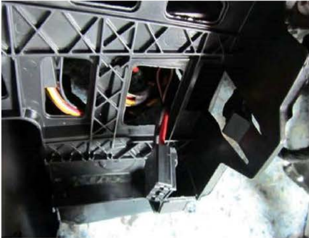
Step 10: Remove the red and black wire