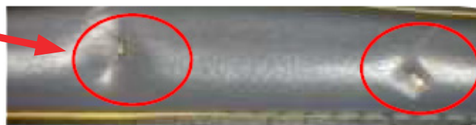
HO2S Protector Tube Damage