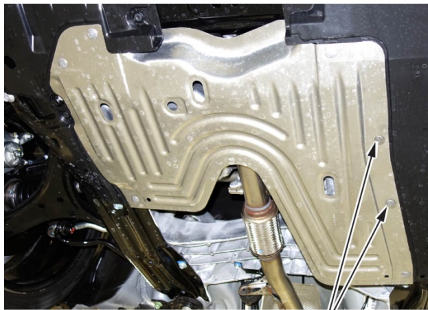
METAL CLIPS (2)