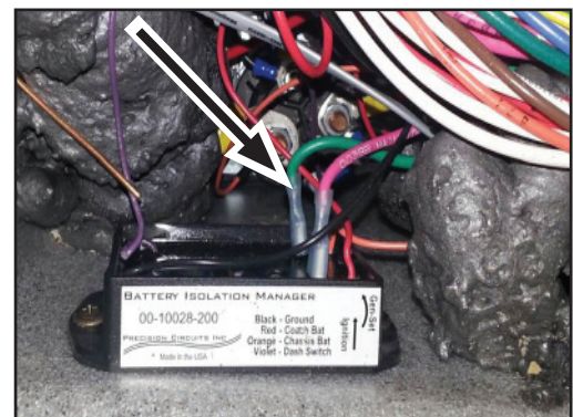
Figure 1 - Battery Isolation Manager Wiring Before Correction

This bulletin is supplied for technical information only and is not an authorization for repairs.