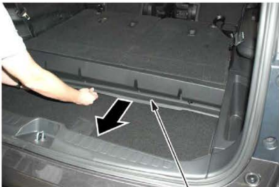
CARGO AREA TRIM