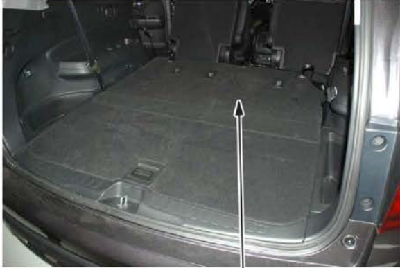
THIRD ROW SEATS