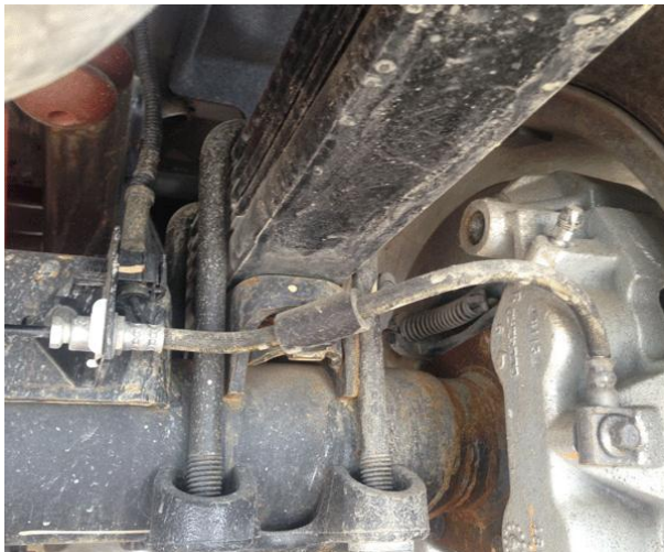
2014-2015 LD Truck Brake Line Bracket and Bolt (1)