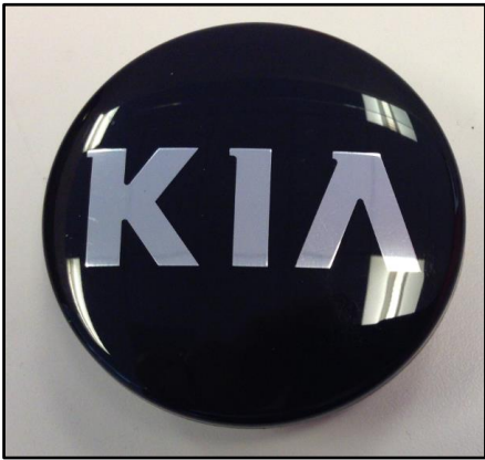
Optima LX Fleet Vehicle Wheel Cap

On some 2015MY Optima LX vehicles sold for Fleet use , dealer personnel may notice that the wheel center cap has a black background and differs in appearance from other Optima LX vehicles. This is normal vehicle contenting and no parts should be replaced in an attempt to match the appearance to retail units in dealer inventory. NOTE: Warranty claims submitted for wheel center cap replacement on fleet vehicles may be subject to chargeback.