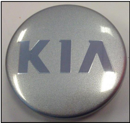
Optima LX Retail Vehicle Wheel Cap