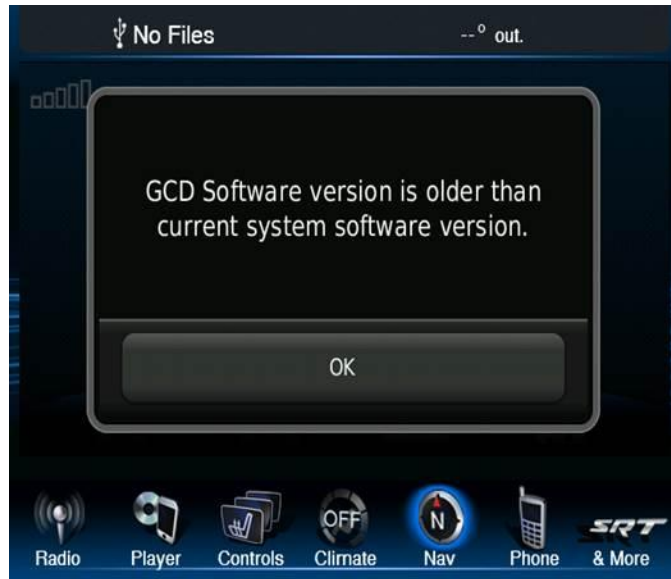
Fig. 6 Garmin Software Already Updated

22. The radio screen will now display one of two pop up screen see (Fig. 6) or (Fig. 7).