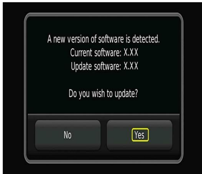
Fig. 7 Garmin Software Needs Updating