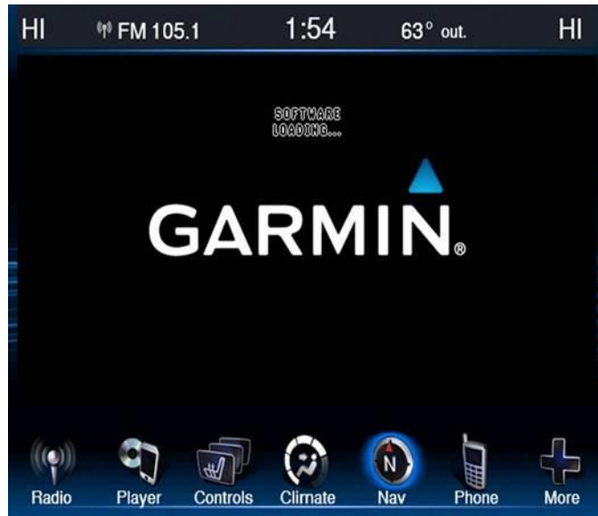
Fig. 8 Garmin Software Loading

25. This next screen will be displayed when the update is being down loaded, see (Fig. 8).