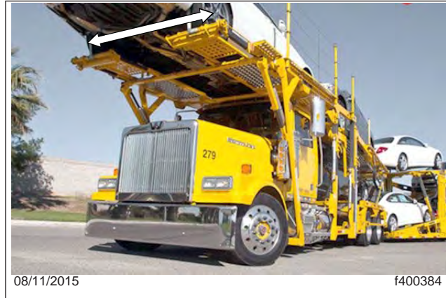
Fig. 1, Centering the Vehicle Over the Cab

> 122SD and Coronado > Business Class M2 Cascadia > 108SD/114SD