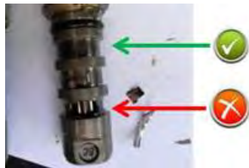
Figure 1. Two top filters are okay, bottom filter is missing.