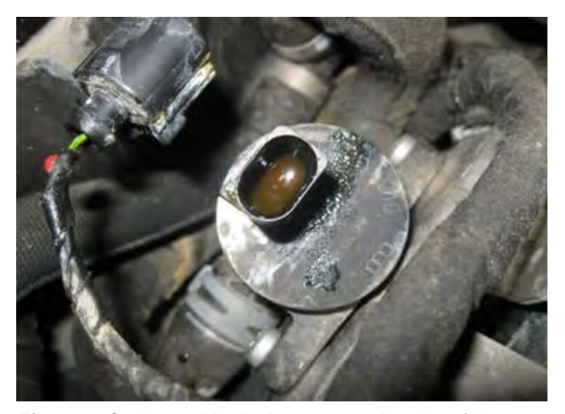
Figure 1. Coolant residue in the connector housing of the coolant regulating valve.

Inspection of the coolant control valves N82, N509, or N488 reveals the presence of coolant inside the electrical connector as shown in the illustration (Figure 1).