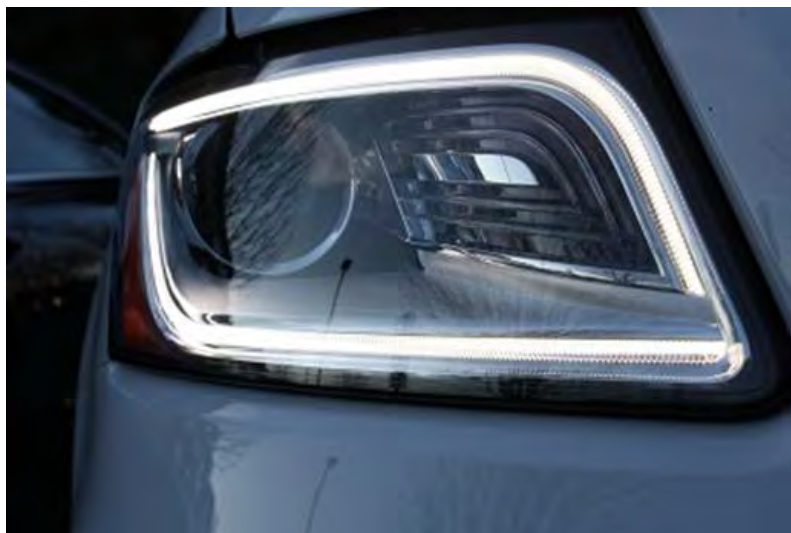
Figure 1. Upper and Lower light pipes illuminated.

The MY2013+ Audi Q5 LED DRLs use light-emitting “pipes” or “guides” instead of multiple, individual LEDs. There are two light pipes per headlight. Each light pipe uses a single LED for illumination (Figure 1).