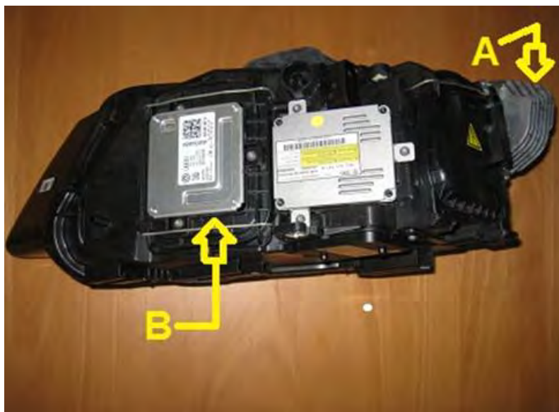
Figure 2. Backside of headlight with LED heat sink (A) and LED control module (B).

The LEDs with heatsinks are contained in a single module (Figure 2, A) mounted to the outer backside of each headlight.