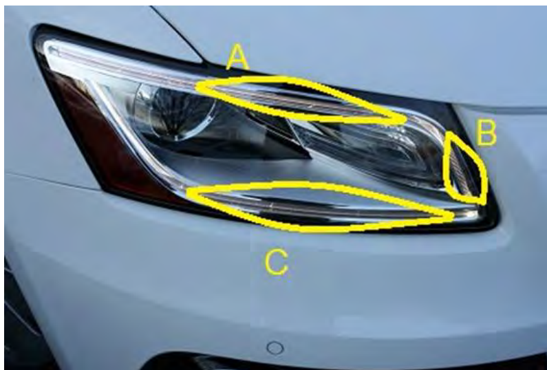
Figure 6. Upper light pipe perceived defect (A, B). Lower light pipe perceived defect (C).