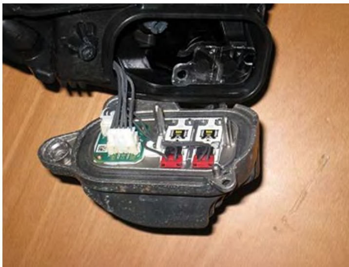
Figure 7: Dual surface mount LED unit exposed.

Be extra careful with red surface mount connectors. In general, a repair kit is not available for any internal headlight connectors.