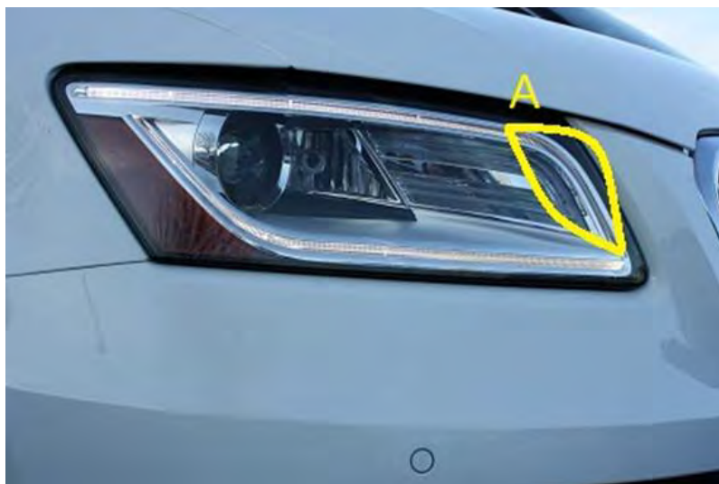
Figure 5. Upper light pipe perceived defect (A).