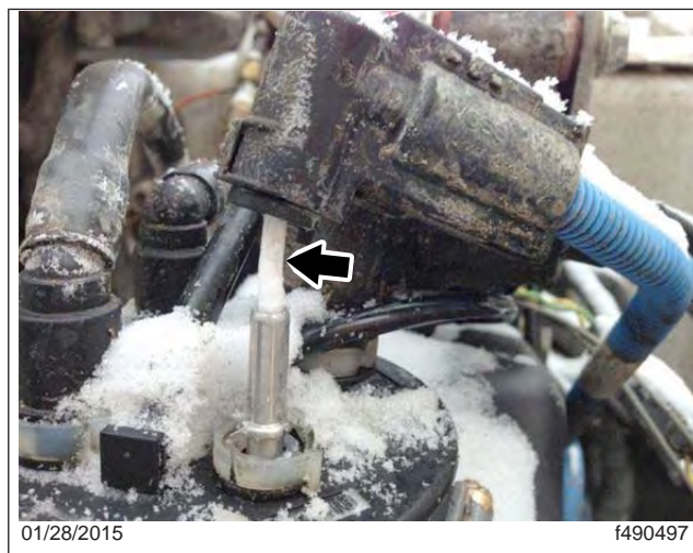
Fig. 1, Ice Expansion at the DEF Line Fitting

Replacing the suction stand pipe involves removing the header from the tank, disassembling the header and reassembling it with the new suction stand pipe that has smaller diameter and a larger fitting. With the larger fitting on the stand pipe, a different DEF line is required to connect to it.