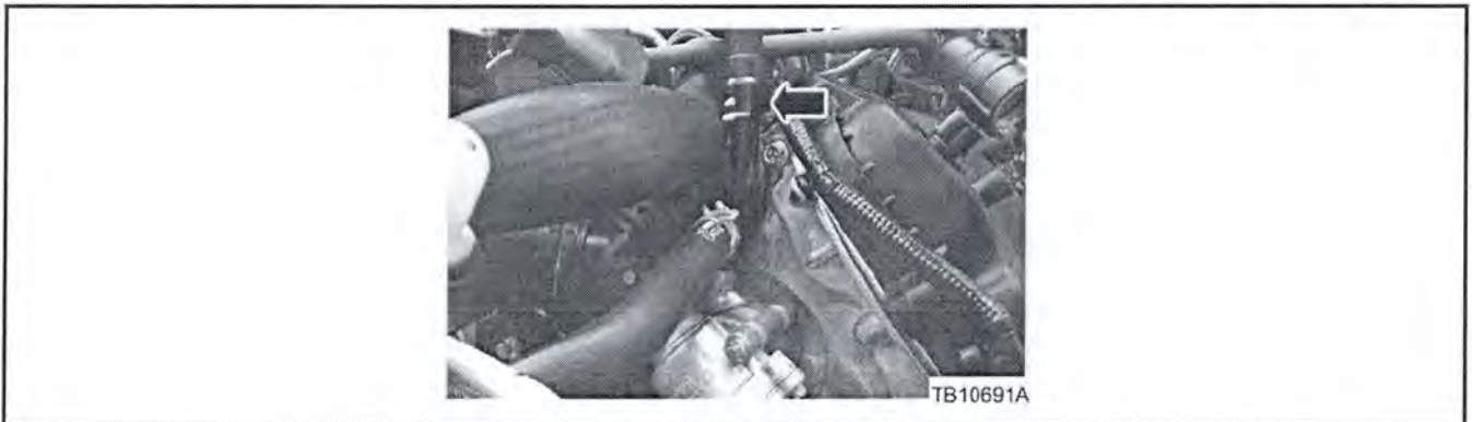
Figure 1 - Article 15-0073