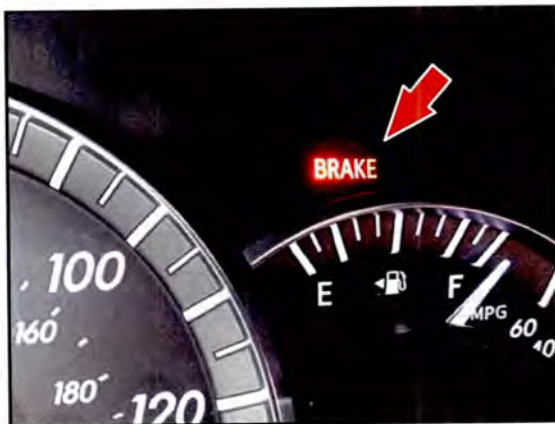
Figure 1. Condition 1: Brake Warning Light