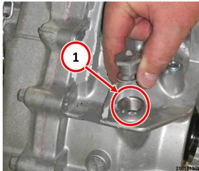
Fig. 2 Transaxle Differential Access