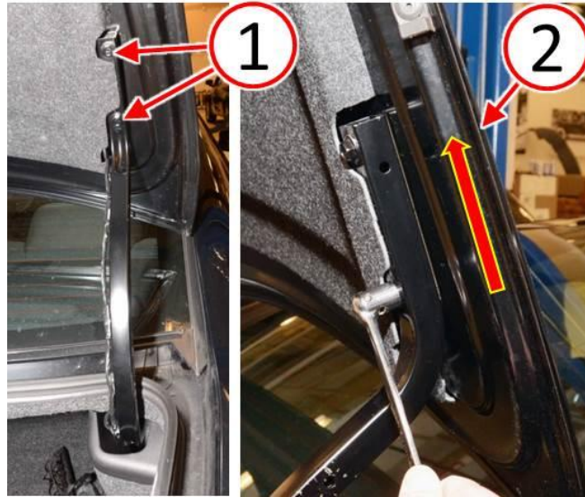
Fig. 6 Adjust Decklid