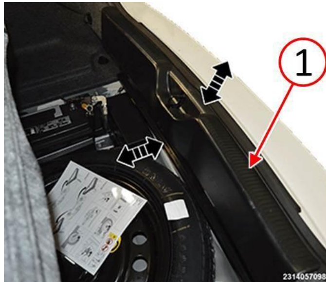
Fig. 8 Install Trunk Trim Panel