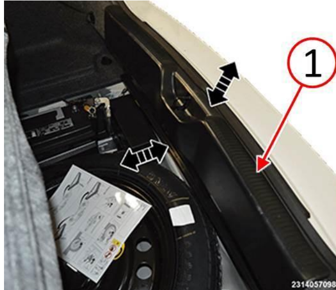
Fig. 3 Remove Trunk Trim Panel