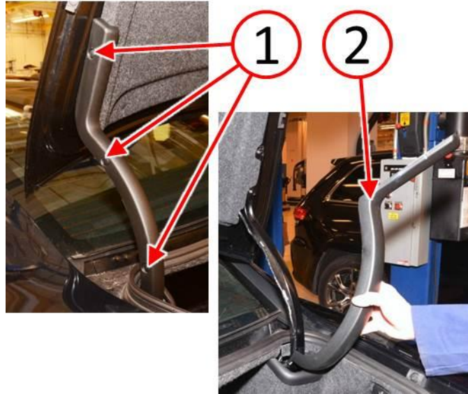
Fig. 7 Install Hinge Covers

18. Install the decklid hinge cover (2) and push fasteners (1) (Fig. 7).