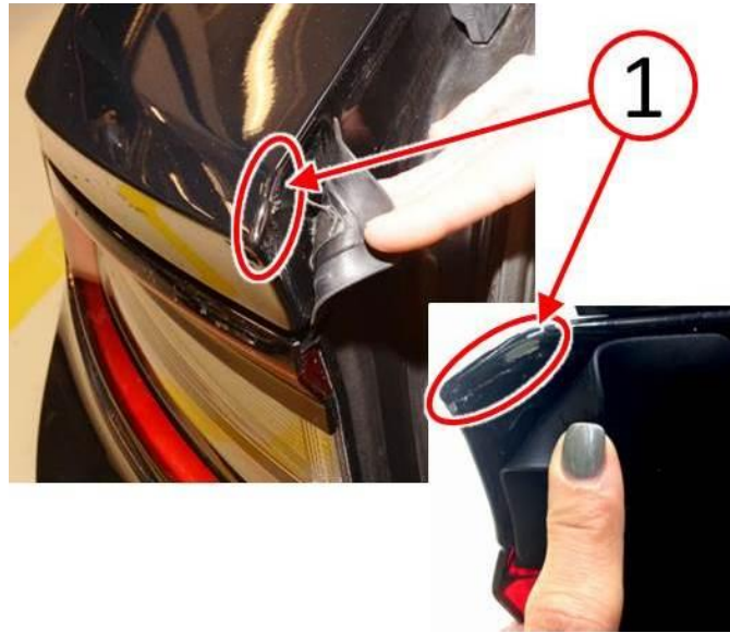
Fig. 9 Touch Up Paint Chips

22. If paint was chipped due to contact between the decklid and body side aperture, touch up the paint as required.