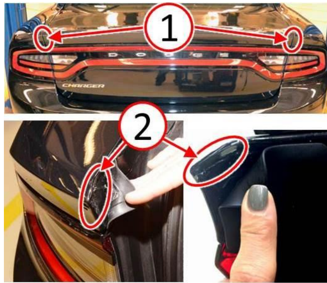
Fig. 1 Contact Areas And Chipped Paint

1 - Decklid To Body Side Aperture Contact