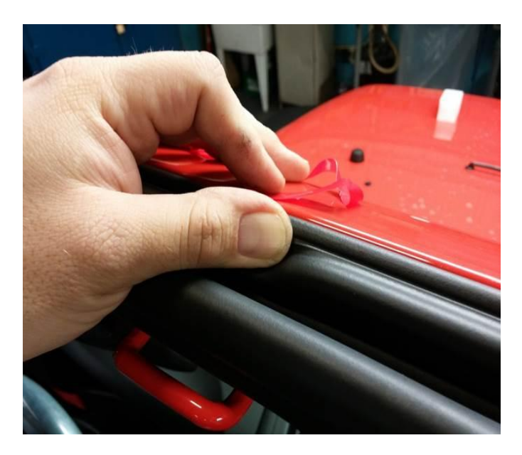
Fig. 25 Release Pressure

19. End at the center of the windshield frame leaving the other half of the tape release liner attached to the seal (Fig. 25). Then repeat steps on the other side of vehicle working from the outside to the center.