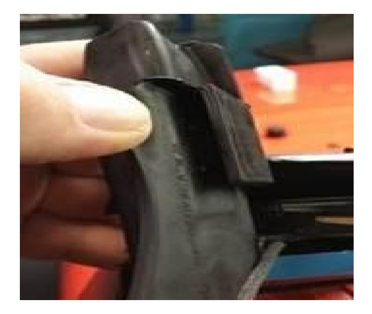
Fig. 12 End Seal Slot

5. Make sure that the slot in the back of the seal (Fig. 12) is seated on the reinforcement flange of the windshield frame (Fig. 13).