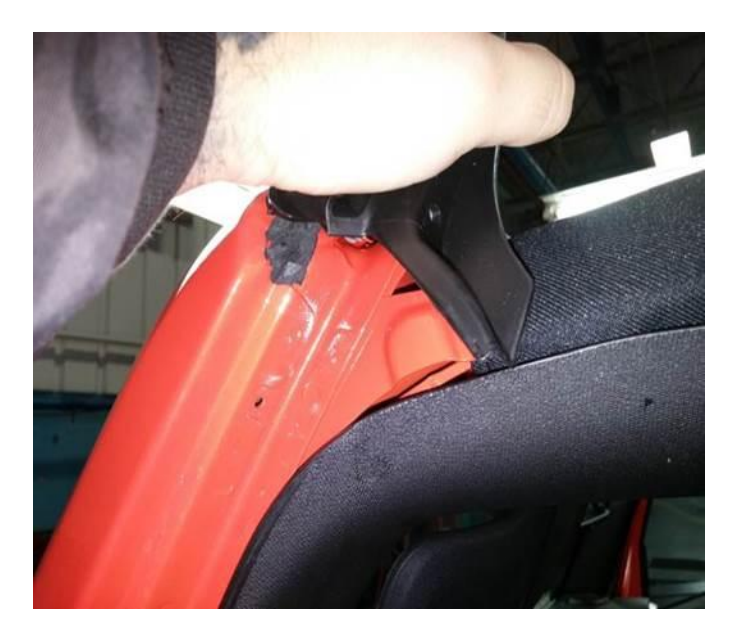
Fig. 3 End Removal

4. Lift the side end molds off of the metal support flange (Fig. 3). Carefully pull the seals end mold away from the windshield frame do not pull the seal by the end mold.(Fig. 4).