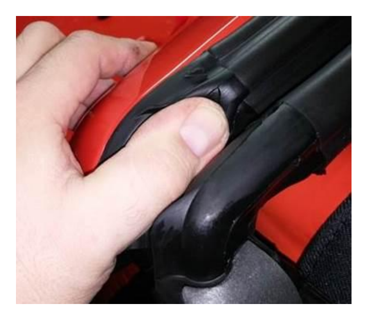
Fig. 21 Seal Corner Alignment

14. Firmly compress the butyl along the remainder of the end mold. Be careful not to seat the adhesive tape beyond the mold line in this process (Fig. 21).