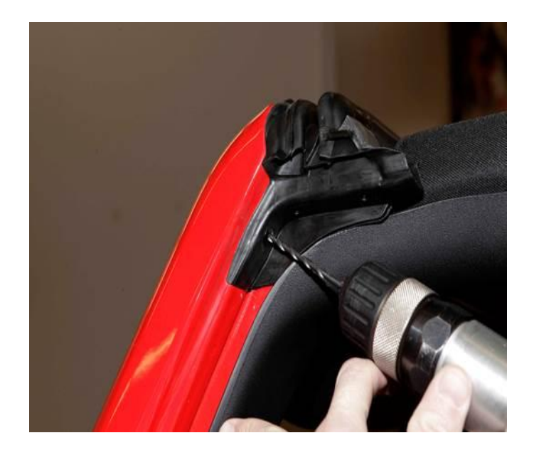
Fig. 2 Drilling out Rivet