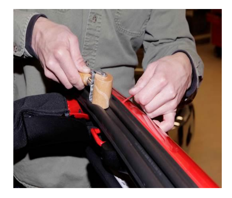
Fig. 24 Using Roller On Seal