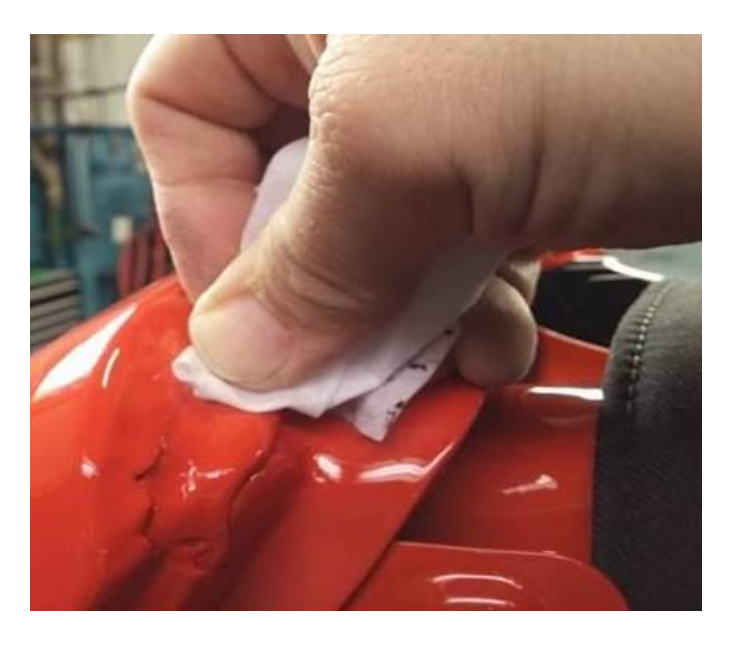
Fig. 7 Alcohol Wipe