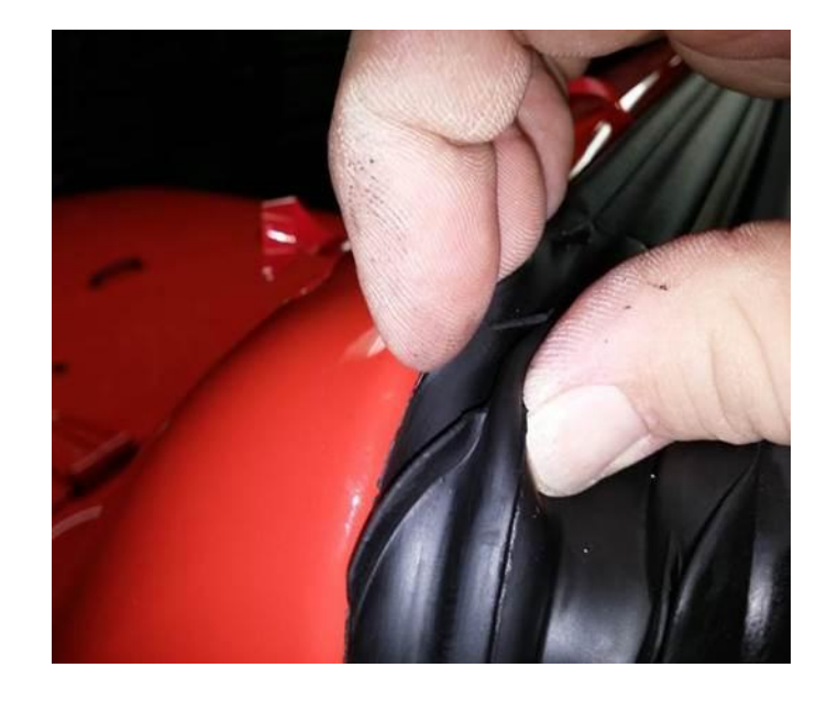
Fig. 20 Seating End Piece Seal At Frame

13. Apply firm pressure to ensure the butyl is compressed properly (Fig. 20).