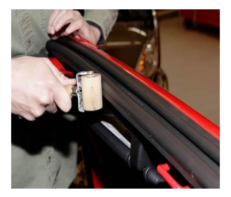
Fig. 23 Smoothing Out Seal

16. Seat the seal to the windshield frame flange starting at the outside and working inward using a small hand roller ending at the center. (Fig. 23).