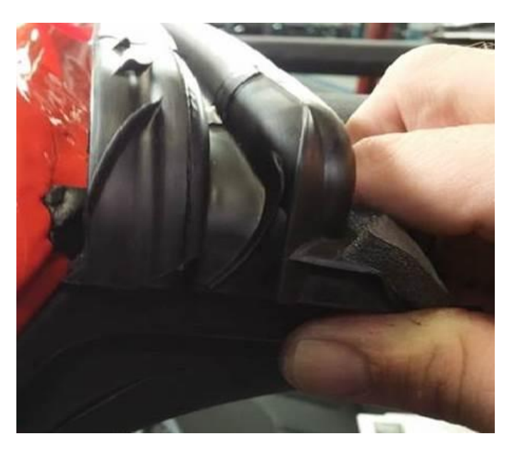
Fig. 17 Seal Forward

Grasp the rear cup of the seals end mold and gently push the seal forward to the frame. Do not allow the adhesive liner contact the windshield frame at this point (Fig. 17).