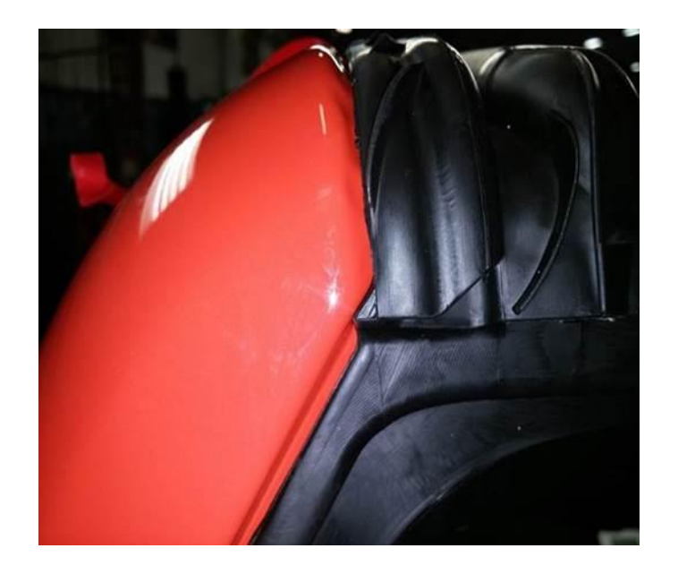
Fig. 18 Profile Fitment

11. Be sure that the end mold corner matches the profile of the windshield frame once again before moving forward. Cross car location is critical (Fig. 18).