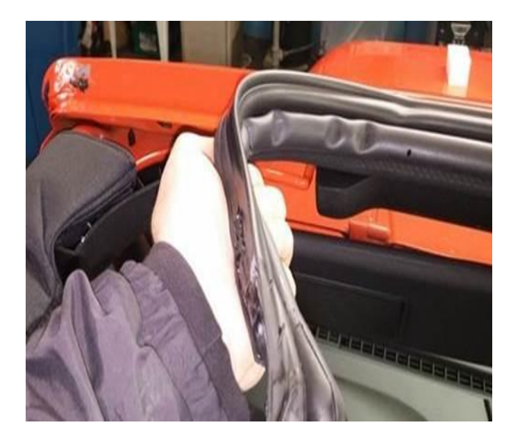
Fig. 4 Header Seal Removal