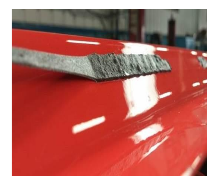
Fig. 6 Angle Pull

2. Pull at a low angle on the remaining adhesive tape (Fig. 6).