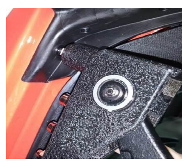
Fig. 22 Riveting

16. Seat the seal to the windshield frame flange starting at the outside and working inward using a small hand roller ending at the center. (Fig. 23).