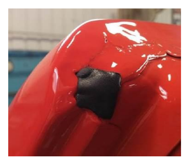
Fig. 9 Butyl square

2. Form a 15mm x 15mm x 1mm piece of butyl and align it as shown on both sides of the windshield frame. Alignment of this patch is critical to avoid interference with the seals adhesive tape (Fig. 9).