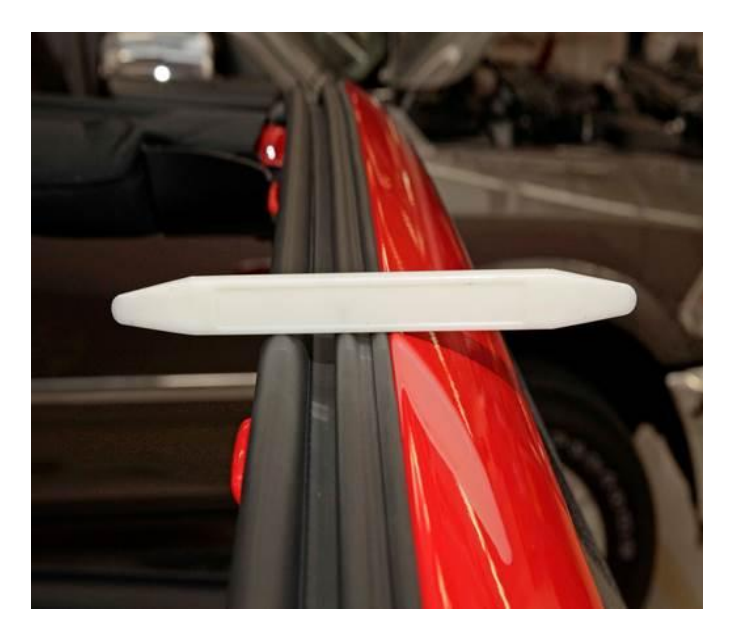
Fig. 26 Level Seal

20. The top of the header seal should be close to even with the top of the windshield frame along the entire seal (Fig. 26).