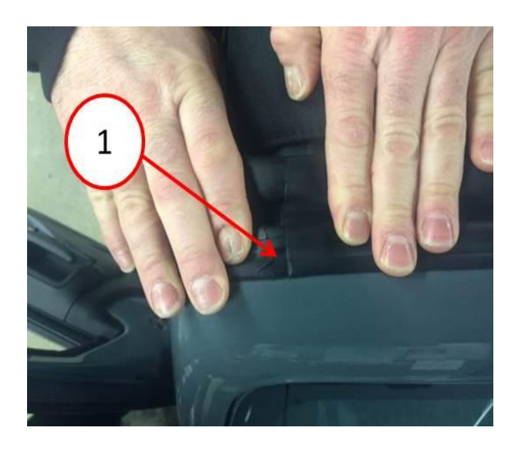
Fig. 1 Header Seal Inspection

Using two hands, simultaneously apply downward pressure 10 times on each side of the joint line on the seal to check for any splits (Fig. 1). Ensure both sides of the vehicle are checked.