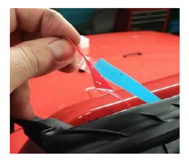
Fig. 16 Removing Adhesive Pulls

9. Carefully pull both release liners until the blue liner is fully removed. Do not continue to pull the red liner past this point. The liners must be carefully pulled directly away from the seal to prevent the butyl from interfering with the adhesive tape (Fig. 16).