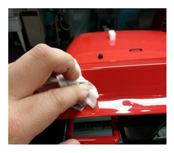
Fig. 10 Adhesion Promoter

Wipe the entire windshield header frame where new seal will be applied with 3M<sup>™</sup> 4298 Adhesion Promoter or Equivalent (Fig. 10) to ensure proper adhesion of the seal to the metal.