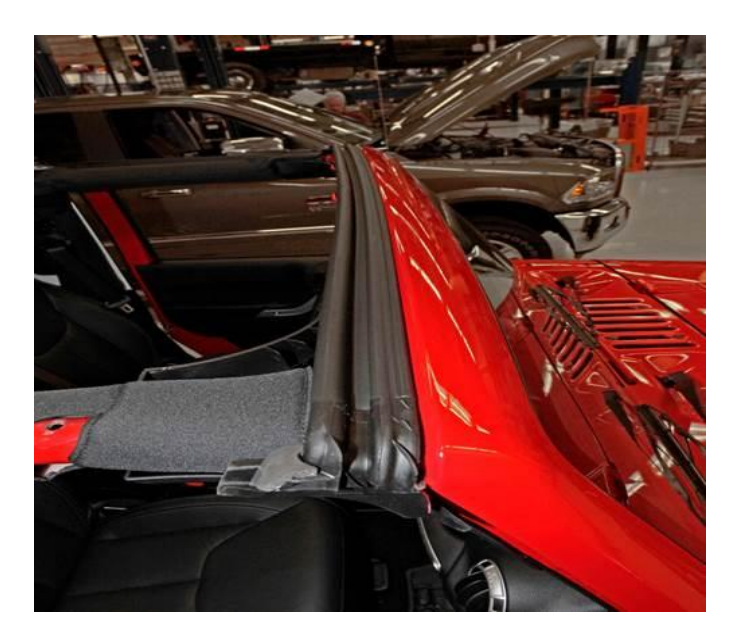
Fig. 11 Seal Alignment

4. Lay the new windshield to header seal across the side bars of the car loosely (Fig. 11).