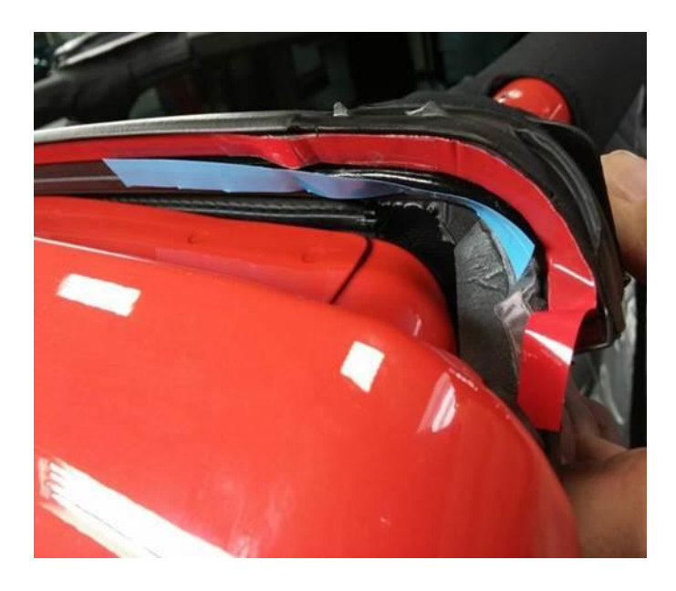
Fig. 15 Rocking The Seal In Place