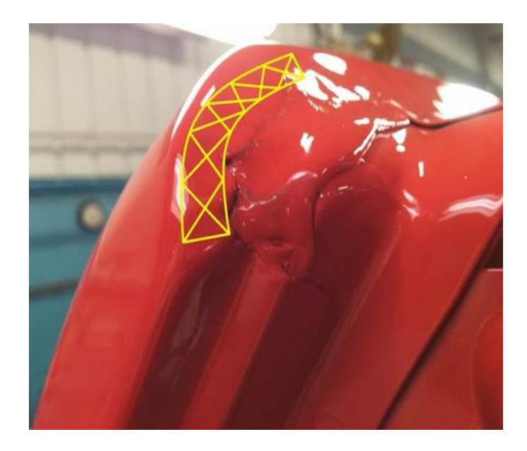
Fig. 8 Butyl Form Location

1. The butyl square must first be reinstalled on the windshield frame. The yellow lines indicate the path of the seals adhesive tape. The butyl must not obstruct the tape or it will prevent adhesion (Fig. 8).