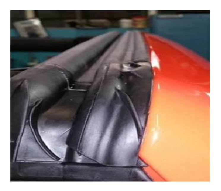
Fig. 27 Properly Aligned Seal

21. A properly installed windshield to header seal will have a uniform height and even appearance along the entire length of the seal, with the seals ends aligning perfectly to the profile of the windshield frame (Fig. 27).