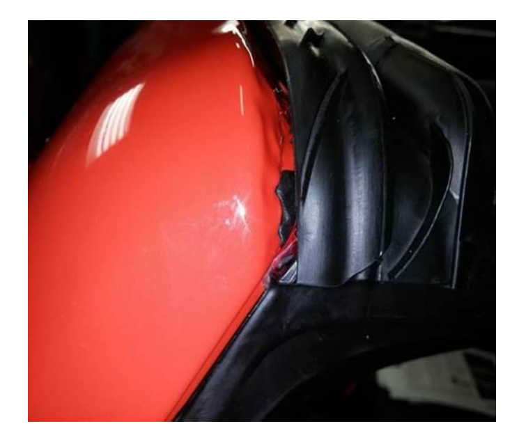
Fig. 14 Profile Placement