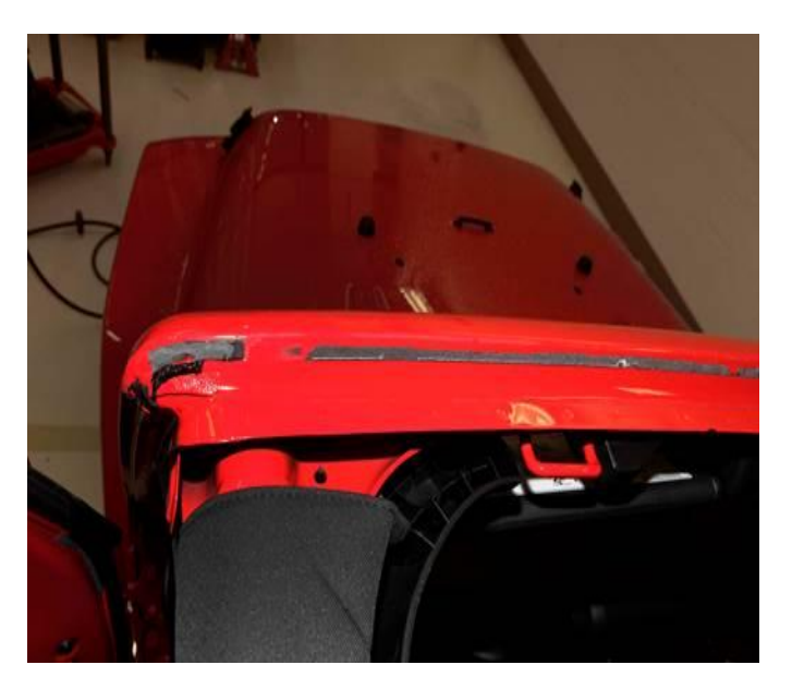
Fig. 5 Removing Residue Butyl

Remove the extra adhesive tape and the butyl from the windshield header frame(Fig. 5).