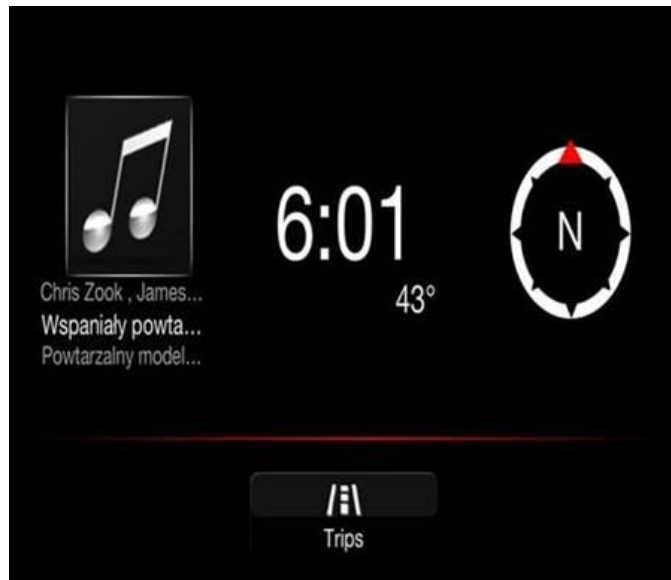
Fig. 1 Display Before Update

The customer may notice that the Sirius XM® travel link button is not displayed on the radio, see (Fig. 1).