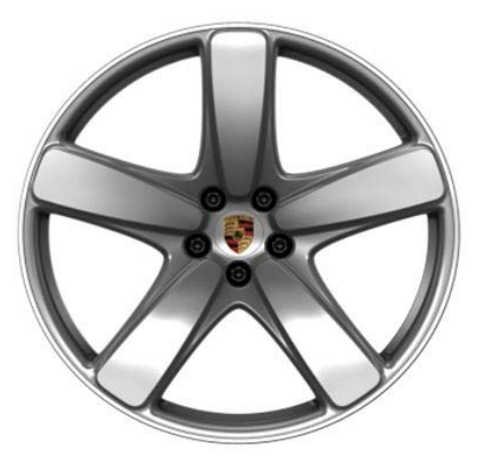
Macan Sport Classic II wheel

Rear: 9 J x 19 H2, RO 21 Part No. 95B.601.025.BL FFF